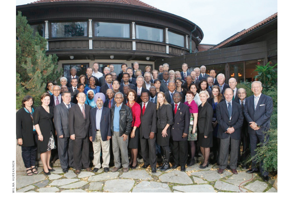
INAPHI members from around the world shared experiences and expertise at the 2011 Annual Meeting in Helsinki, Finland.