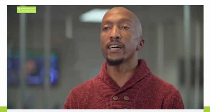
YOUTUBE.COM Dipotso ka ente ya COVID-19 Dipotso ka ente ya COVID-19

🌣 · See original · Rate this translation